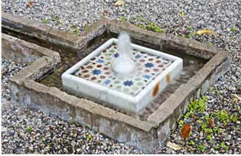
Among the garden's water features, added by architect Brian Talbot, are Moroccan-inspired spillways and fountains. Water flows from a separate fountain in the middle of the swimming pool.