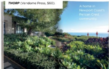
A home in Newport Coast's Pelican Crest community.