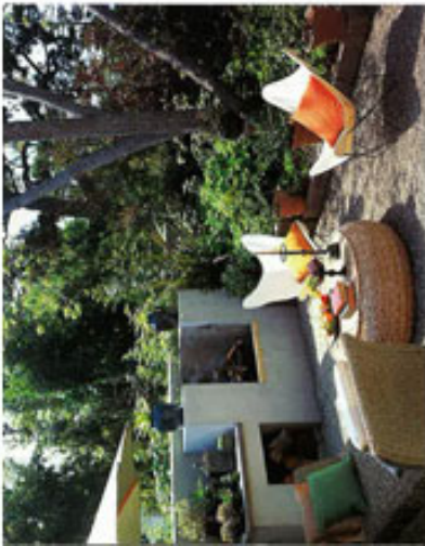
(Left) Outdoor living room with fireplace and wood storage