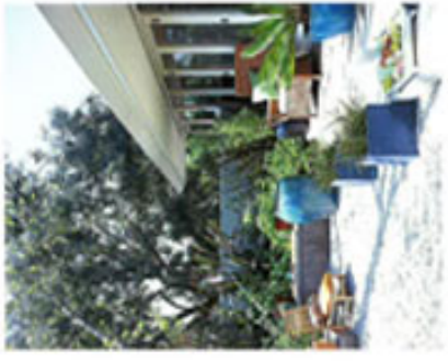
(left) Pool and pavilion complete (above) Designed with large trees