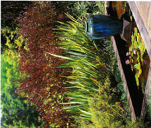
Above, left: Pond with an fountain spouts at the swimming pool, with plantings of Conoclinium volubile , Phormium tenax , Cyperus rotundus , and Stylosanthes .