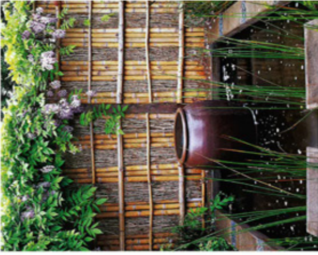
Above, left: View toward square stone pool with the "Moon Crest", Isagoras chinensis , Scirpus japonicus , Alismula , and Lythrum .