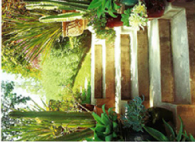
Above, right: Spout at pool framed by vertical cactus plants, succulents and flowers in pots.